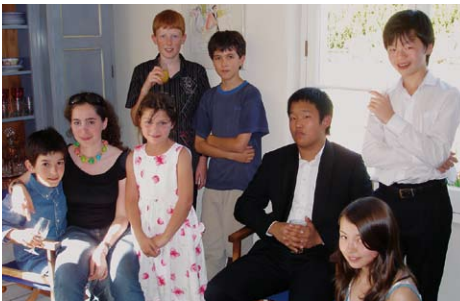
Junior Academy performers