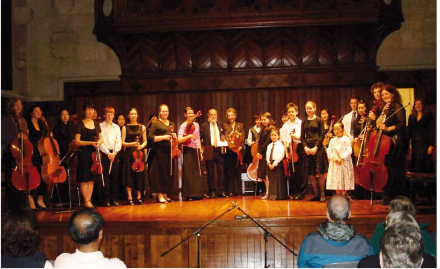
The Pettman Junior Academy of Music presents a selection of Canterbury's finest young musicians and a night of splendid music.