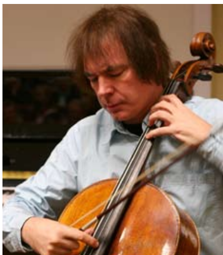
Julian Lloyd Webber

Christchurch was privileged to be visited by the renowned cellist Julian Lloyd Webber, who performed the Elgar Concerto with the New Zealand Symphony Orchestra at the Christchurch Town Hall.